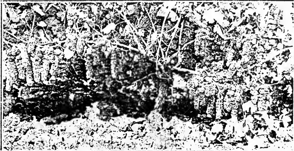
BLACK CORINTH GRAPE VINE YIELDING BIG

In the variety test plots at Davis there are approximately 200 varieties of "juice grapes," 100 varieties of table grapes, seven varieties of raisin grapes, ninety varieties of "so-called Eastern or slip-skin" grapes, and thirty varieties of phylloxera resistant vines. The pruning plots cover some thing like five acres. In these studies various types of pruning are being tested out on forty-four varieties. Six hundred thirty vines of Muscat are under test to determine the reliability of "bud selection" as a means of increasing quality and yield.